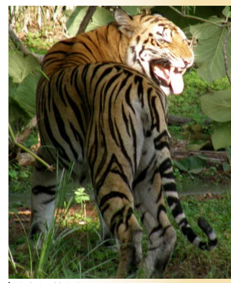
► Indian Coral tree

The wild tiger is a keystone species in many of Asia's protected areas, and is revered and feared in equal measure. Nonetheless, our fascination with the species has not protected it from multiple threats which have rapidly and steadily decimated their numbers and range. Today, less than 4,000 wild tigers remain worldwide. The Satpuda Highlands of Central India arguably represent the best chance wild tigers have for survival. Here, the partners of the Satpuda Landscape Tiger Partnership (SLTP), funded by the Born Free Foundation, are working relentlessly to stem the tiger's decline and aid its recovery. Throughout 2015/16, the SLTP's eleventh year, the network has maintained this dedication with a range of activities, including legal representation, landscape monitoring and lobbying, field research, mitigation of human tiger conflict, health care provision, environmental education and sustainable livelihood initiatives. The co-ordination enabled through the SLTP network ensures that measures to reverse and mitigate threats to tiger conservation can be delivered in a consistent and cost effective manner, benefiting tigers and people alike.