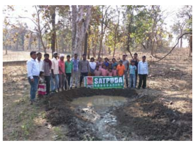
▶ Team pose next to water hole constructed through shramdhaan

This year, the TRACT team helped to raise awareness of this scheme and its benefits through informal meetings with elders and other villagers. This scheme introduces various handholding measures to reduce people's dependence on the forest, develop livelihood opportunities, and provide