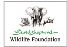
David Shepherd Wildlife Foundation