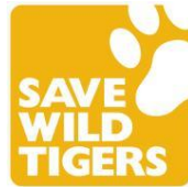
Save Wild Tigers