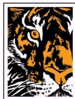
Wildlife Protection Society of India