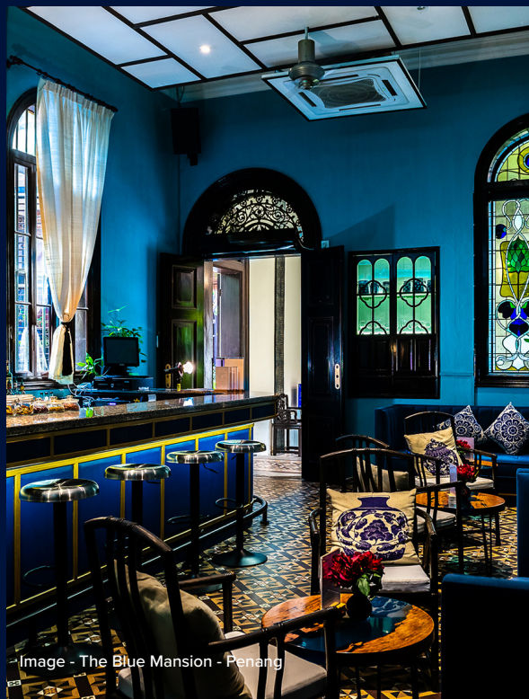
Image - The Blue Mansion - Penang