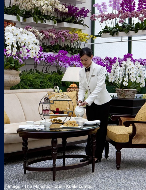
Image - The Majestic Hotel - Kuala Lumpur