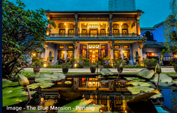
Image - The Blue Mansion - Penang

*All culinary evenings will also fully cater for any specific food requests and preferences for our individual guests.