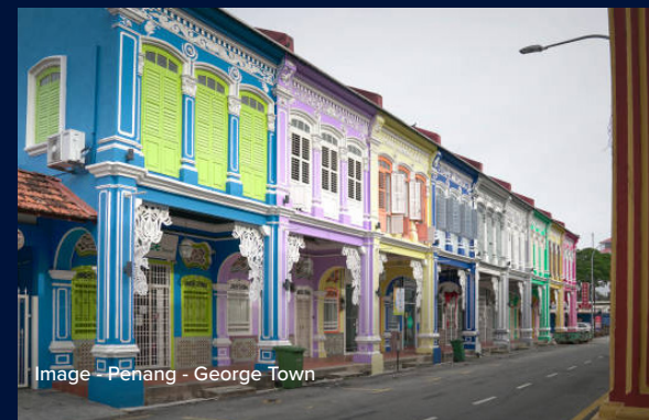
Image - Penang - George Town